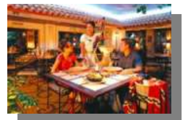
* Pepper Restaurant

For further information and inquiries please contact: info@sanur-beach-hotel.com